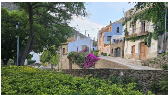
Charming narrow passages and street corners

We're a small town with surprises on every corner for those who want to discover them. Let yourself get lost in our narrow streets; you'll run across the hidden secrets of our cultural and gastronomic heritage.