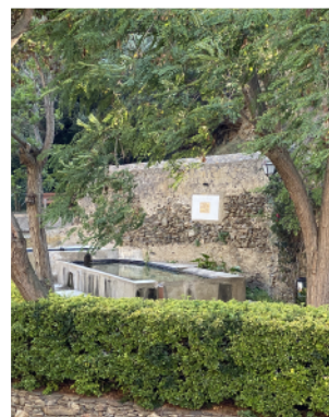
The municipal laundry