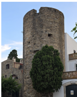
The defensive tower of Camp de l'Obra